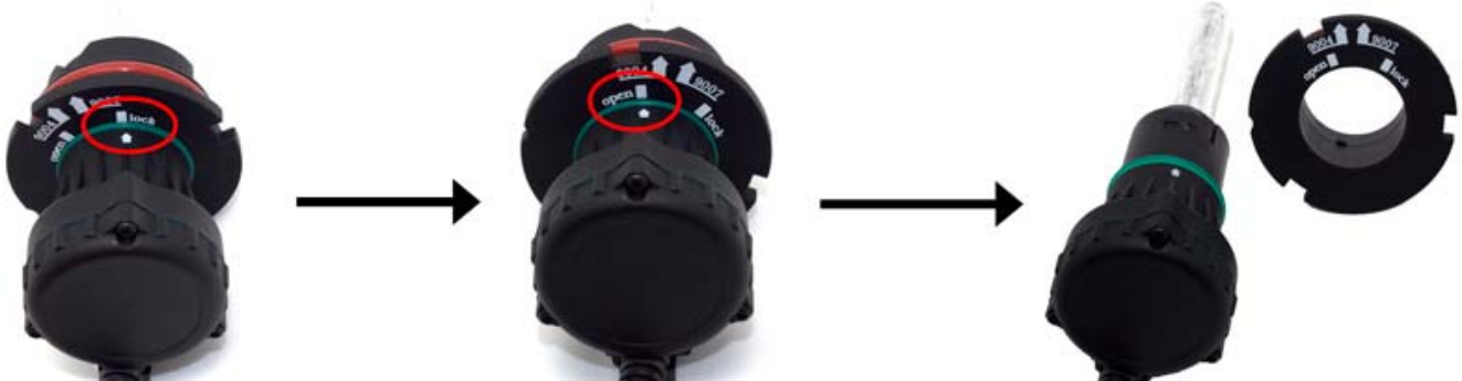
Notice arrow pointing at 'lock' Twist bulb counter clockwise from base Remove bulb from base

5. Install and secure the 90047 Bi-Xenon Bulbs into the headlight housing (reverse of how you remove your existing halogen bulbs). The base and the actual bulb on the 90047 Bi-Xenon Bulb can be split into 2 pieces to make your installation easier. We recommend you to split the 2 pieces apart when installing to ensure that you don't accidentally touch the glass on the bulb. Install the base first, then insert bulb back into base and twist lock.