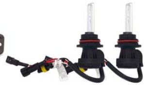
2 x 90047 Bi-Xenon Bulbs

2. This kit is designed to work with both 9004 and 9007 bulb applications. Determine if you need 9004 or 9007 for your vehicle's application (you can check your vehicle's owner manual).