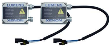
2 x Ballasts

1. Check contents of your kit. You should have: